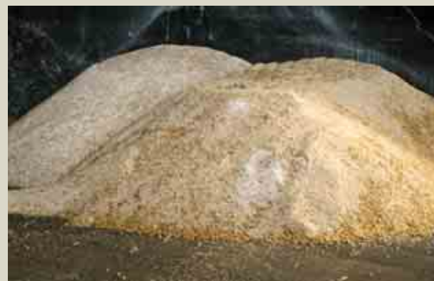
By increasing meal feeding levels by 1kg per head per day, you will reduce the monthly fodder demand for cows, stores and weanlings by 200kg.

If you have identified a fodder deficit, try to reduce demand instead of rushing out to buy additional fodder. One way to reduce demand without having a negative impact on performance is to introduce additional concentrates. At €160 to €180 per tonne for ration, a round bale of silage is worth €15 to €20. As a rough guide for every additional 1kg of concentrate you introduce per day, you will reduce the silage intake figures detailed in Table 1 by 200kg per month.