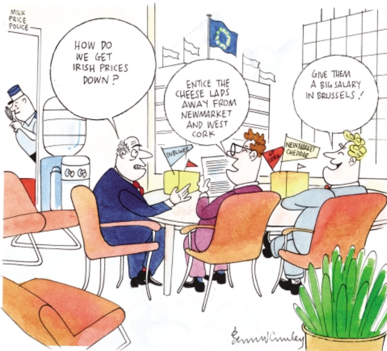
• It is speculated that Brussels has a special committee to cut Irish milk prices.

The Kerry price at this level places them close to the Arla Denmark price in the International Table and ahead of German giants Humana. All confirming the point made at the IFA Cork seminar re the closing of the gap between Irish and continental milk prices.