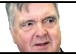
JOE REA IRISH FARMERS JOURNAL

25.16c/l is a special number in Irish Milk Price Comparison. It is special because in old money it is the equivalent of 90 pence per gallon. Now for the first time since 1988 a number of creameries have breached this 25.16c/l barrier.